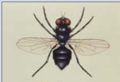
Figure 10. Garbage fly.