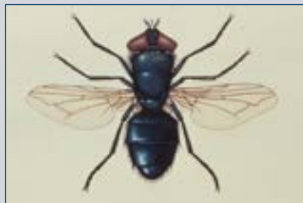
Figure 9. Blow fly.

House flies tend to predominate in poultry regions of the United States, but other species like the ones below may be more common in other areas of the world.