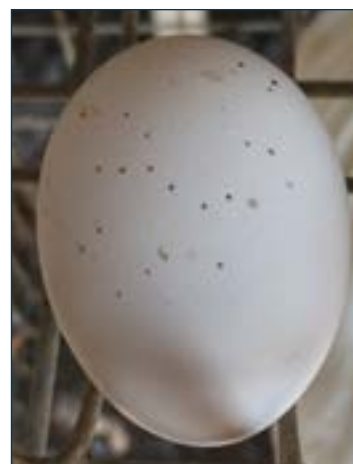
Figure 7. An egg with many fly spots indicates a fly problem.