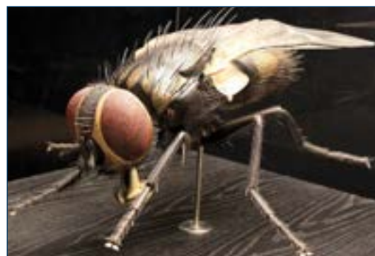
Figure 1. Musca domestica .