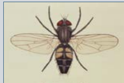
Figure 11. Lesser house fly.