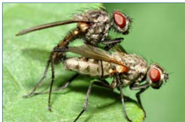
Figure 5. Flies breeding.

Fly larvae have chewing mouth-parts, and consume any rotting organic material in their environment. Adult flies have sucking mouth-parts (proboscis), and must consume food that is already in a liquid state, or can be dissolved by their acidic saliva. Eggs and pupae stage flies do not eat, and survive entirely on stored energy 9 .