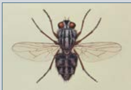
Figure 13. Stable fly.