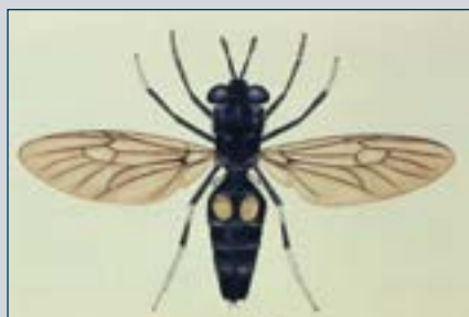
Figure 12. Soldier fly.