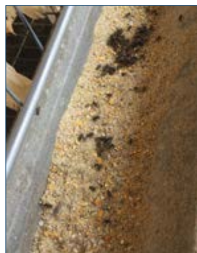
Figure 8. Flies are attracted to feed. This reduces feed efficiency for the flock and increases the risk of contamination.